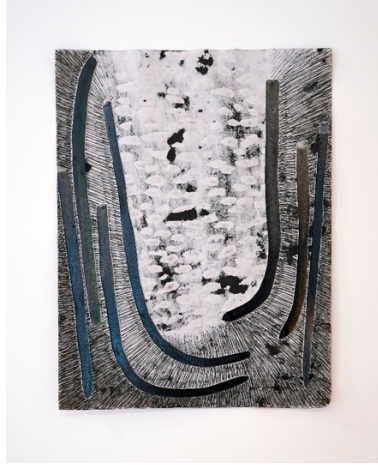
It's all about perspective Acrylic, ink and collage on watercolor paper and rice paper 13.5"x10.5" 2022