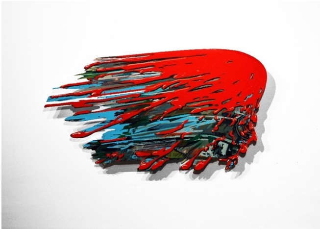
Splatter Oil on Dibond 14" x 26" x 1" 2018