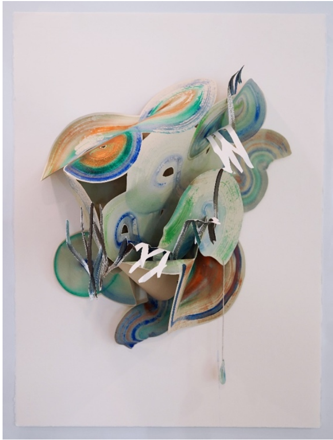
Sad little cloud (hanging over my head)

Acrylic, string and dimensional collage on paper 30" x 22.5" x 9" 2021