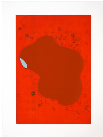
Remains I Screen print monotype with Caran d'ache and collage 14" x 10.5" 2023