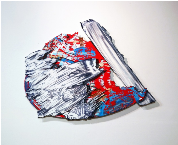
Back Up Oil on Dibond 24" x 31" x 1" 2018