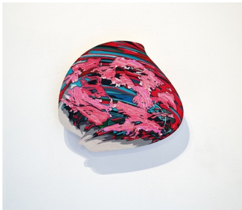
Just Breathe Oil and acrylic on Dibond 12" x 14" x 1" 2018