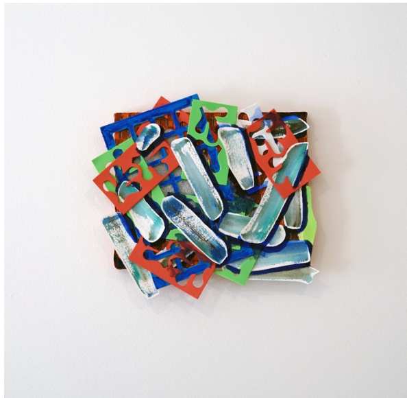
Red green blue, I love you Acrylic, foam, cardboard remnant, and ribbon on paper and panel 11" x 12" x 1.25" 2023