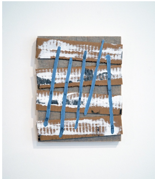
Rainy day at the shore Acrylic, graphite and ink on paper, cardboard and panel 10" x 8.25" x 1"