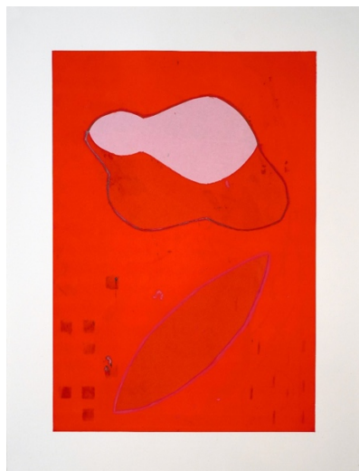
Remains II Screen print monotype with Caran d'ache and collage 14" x 10.5" 2023