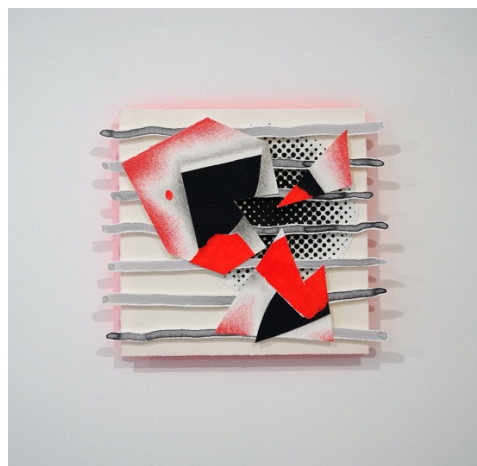
Let's come to the point Acrylic ink, graphite, colored pencil and screen print on paper, foam board and panel 9" x 10" x 1" 2022