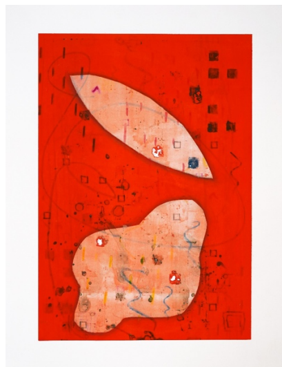
Remains IV Screen print monotype with Caran d'ache and collage 14" x 10.5" 2023