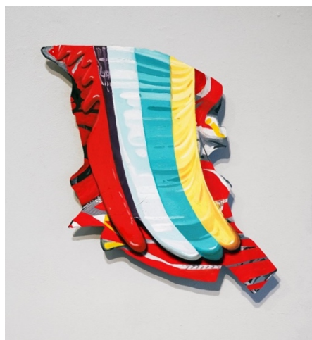
Stripes Oil on Dibond 24" x 24" x 1" 2018