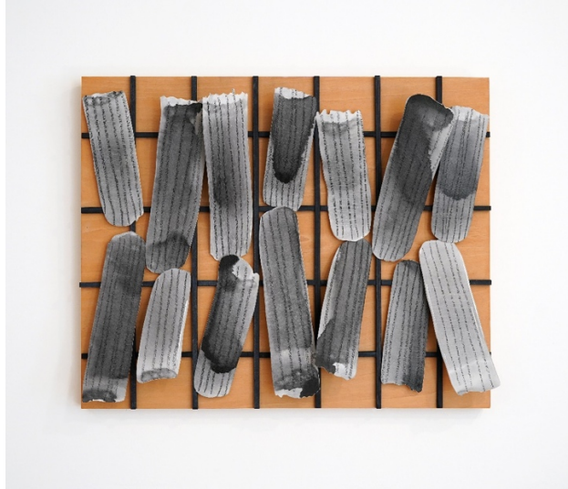
Fault line Ink, acrylic, litho crayon, and foam board on panel 16" x 20" x 3" 2022