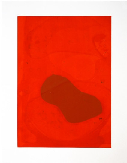
Remains III Screen print monotype with Caran d'ache and collage 14" x 10.5" 2023