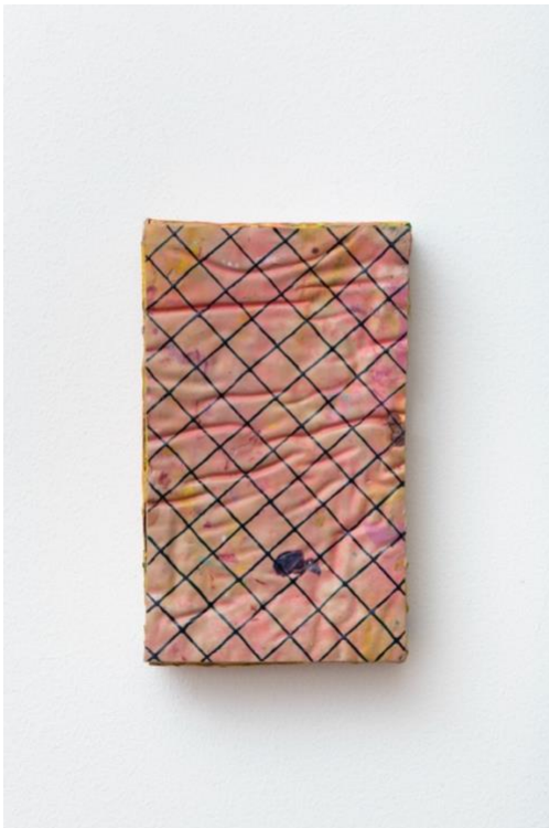
JEN NOONE LOOK AT ME, DON'T LOOK AT ME, 2022 INK, LATEX AND ACRYLIC PAINT 7.25 x 4.25 x 1.25 IN.