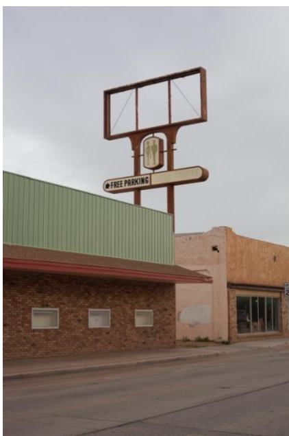
KIM LLERENA WINSLOW, ARIZONA (FREE PARKING, OPEN TONITE), 2017 ARCHIVAL PIGMENT PRINT 18 X 12 IN. EDITION OF 3