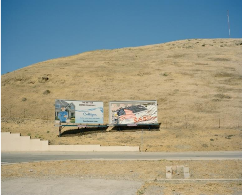
KIM LLERENA SAN LUIS OBISPO, CALIFORNIA (CULLIGAN WATER, JP SOLAR, DROUGHT), 2017 ARCHIVAL PIGMENT PRINT 20 X 25 IN. EDITION OF 3