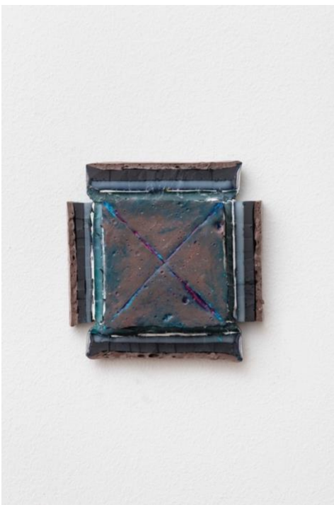
JEN NOONE OUTSIDE IN, 2022 ADHESIVE SEALANT, GEL MEDIUM, LATEX, ACRYLIC AND LEATHER PAINT 4 x 3.75 x 1 IN.