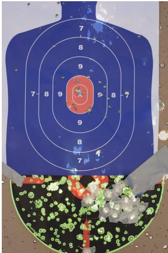
KIM LLEREENA RT. 93 EAST, NEVADA (SHOOTING RANGE), 2017 ARCHIVAL PIGMENT PRINT 18 X 12 IN. EDITION OF 3