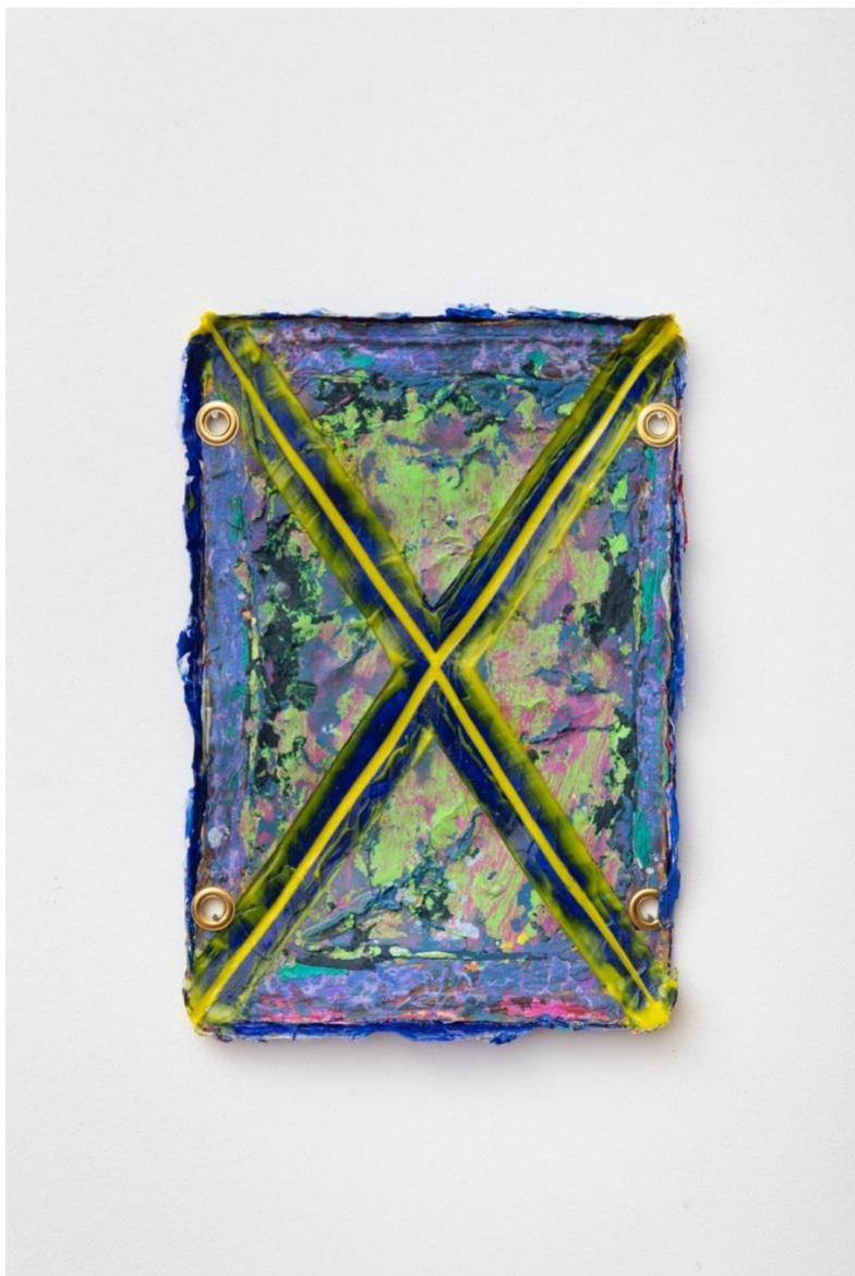
JEN NOONE SO PUT TOGETHER, 2022 GROMMETS, GEL MEDIUM, LATEX AND ACRYLIC PAINT 13.5 x 9 IN.