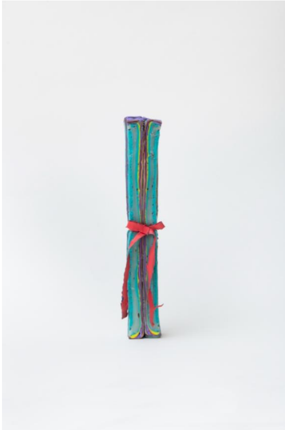
JEN NOONE SQUEEZE, 2022 GEL MEDIUM, LATEX, ACRYLIC, FLEXIBLE ACRYLIC AND MIRROR PAINT 7.5 x 1.25 x 0.75 IN.