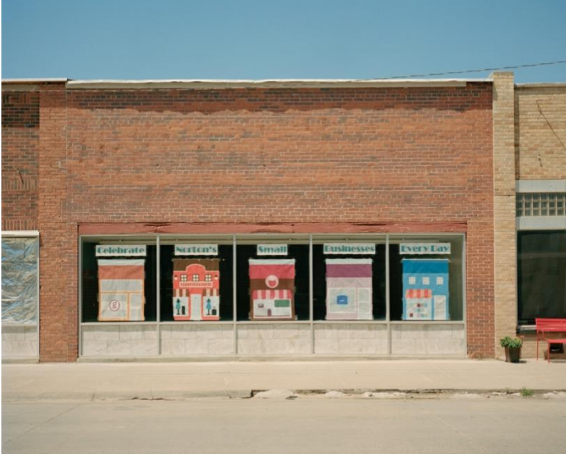
KIM LLERENA NORTON, KANSAS (CELEBRATE NORTON'S SMALL BUSINESSES EVERY DAY), 2017 ARCHIVAL PIGMENT PRINT 16 X 20 IN. EDITION OF 3