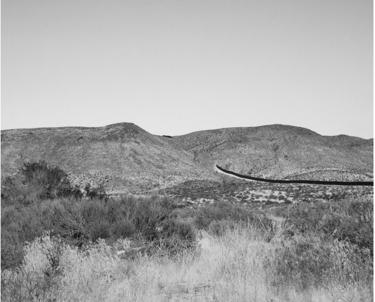
KIM LLERENA JACUMBA, CALIFORNIA (BORDER WALL, GAP), 2017 ARCHIVAL PIGMENT PRINT 20 X 25 IN. EDITION OF 3