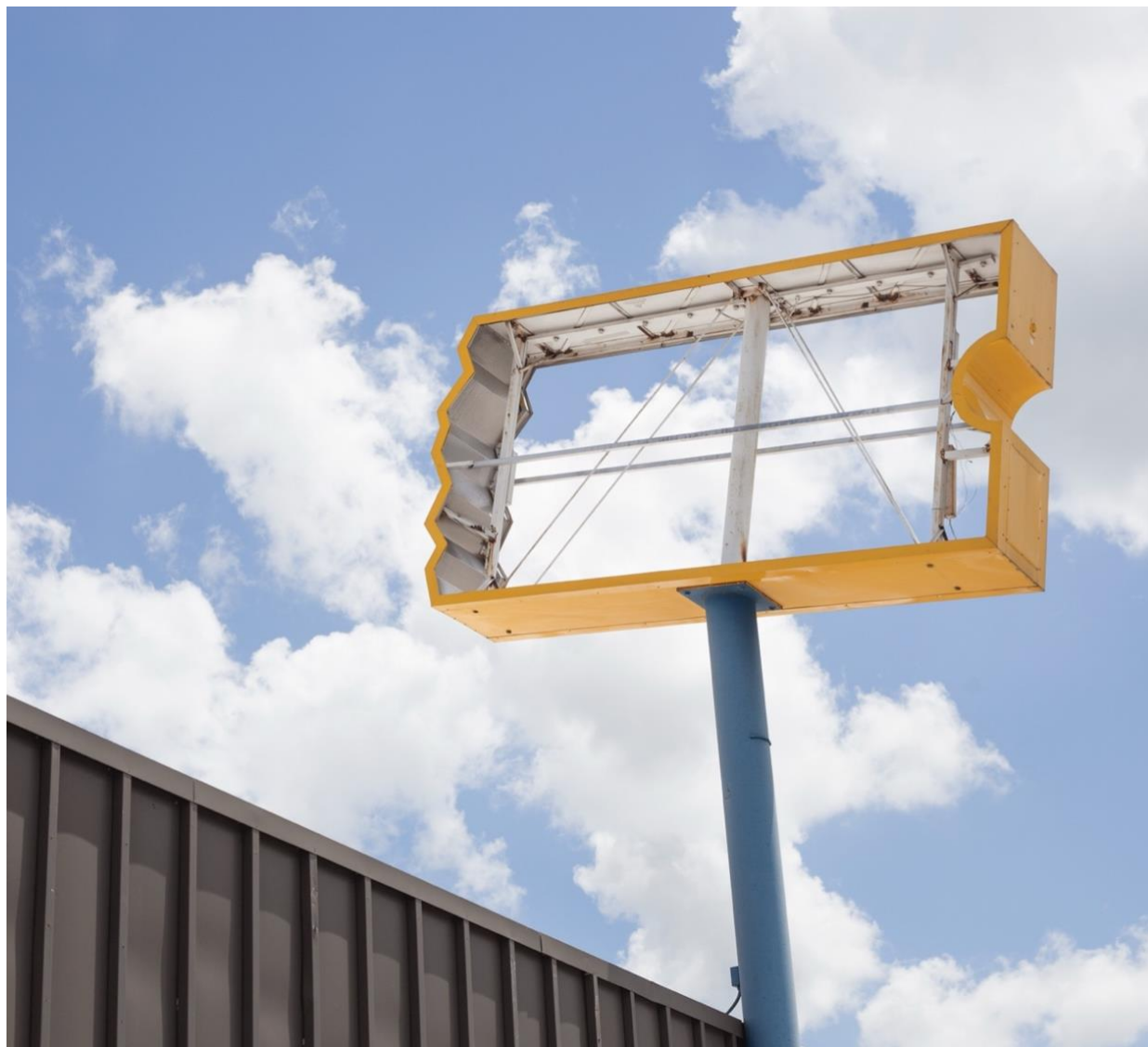
KIM LLERENA, UVALDE, TEXAS (BLOCKBUSTER), 2017 ARCHIVAL PIGMENT PRINT 8 X 10 IN. EDITION OF 3