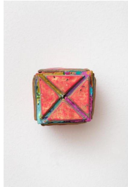
JEN NOONE, HOT BUTTON ISSUE, 2022 LATEX AND ACRYLIC PAINT 2.25 x 2.5 x 2.25 IN.