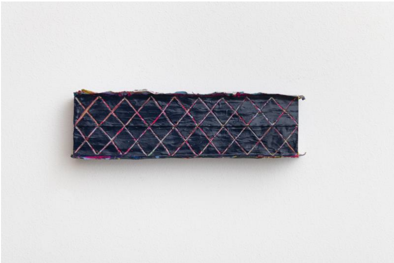
JEN NOONE FRET/WERK, 2022 LATEX AND ACRYLIC PAINT 9.25 x 2.75 x 1.25 IN.