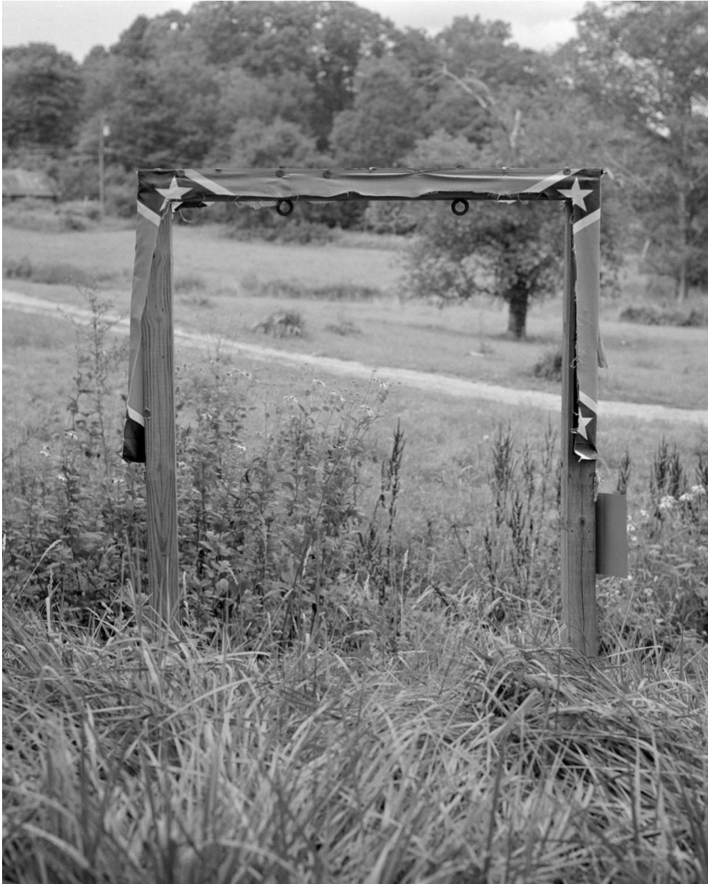
KIM LLEERENA, WATAUGA COUNTY, NORTH CAROLINA (REMNANT), 2017, ARCHIVAL PIGMENT PRINT, 30 X 24 IN. EDITION OF 3