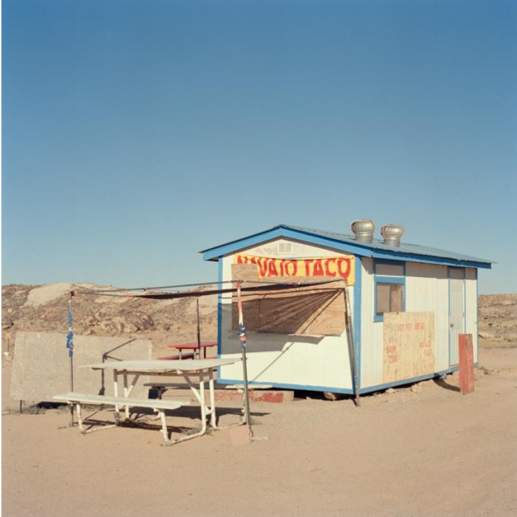
KIM LLERENA, FOUR CORNERS MONUMENT NAVAJO TRIBAL PARK, NAVAJO NATION, COLORADO, NEW MEXICO, ARIZONA, UTAH (NAVAJO TACO), 2017 ARCHIVAL PIGMENT PRINT 15 X 15 IN., EDITION OF 3