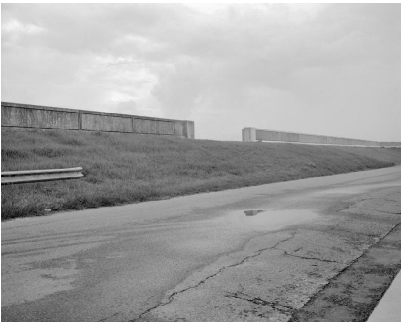
KIM LLERENA ST. BERNARD PARISH BORDERING NEW ORLEANS, LOUISIANA (FLOOD WALL, GAP), 2017 ARCHIVAL PIGMENT PRINT 20 X 25 IN. EDITION OF 3