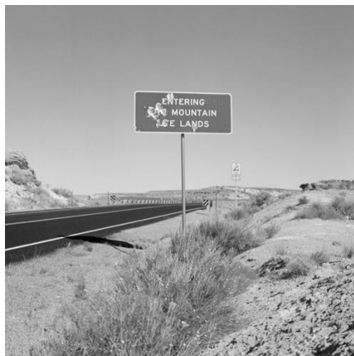
KIM LLEREENA RT. 41 SOUTH NEAR UTE MOUNTAIN UTE INDIAN RESERVATION, COLORADO (BULLET HOLES), 2017 ARCHIVAL PIGMENT PRINT 15 X 15 IN. EDITION OF 3