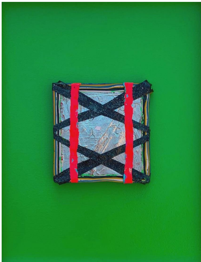
JEN NOONE, STRAPPED IN, 2022, LATEX, ACRYLIC, GLITTER AND MIRROR PAINT ON BOARD, 14 x 11 IN.