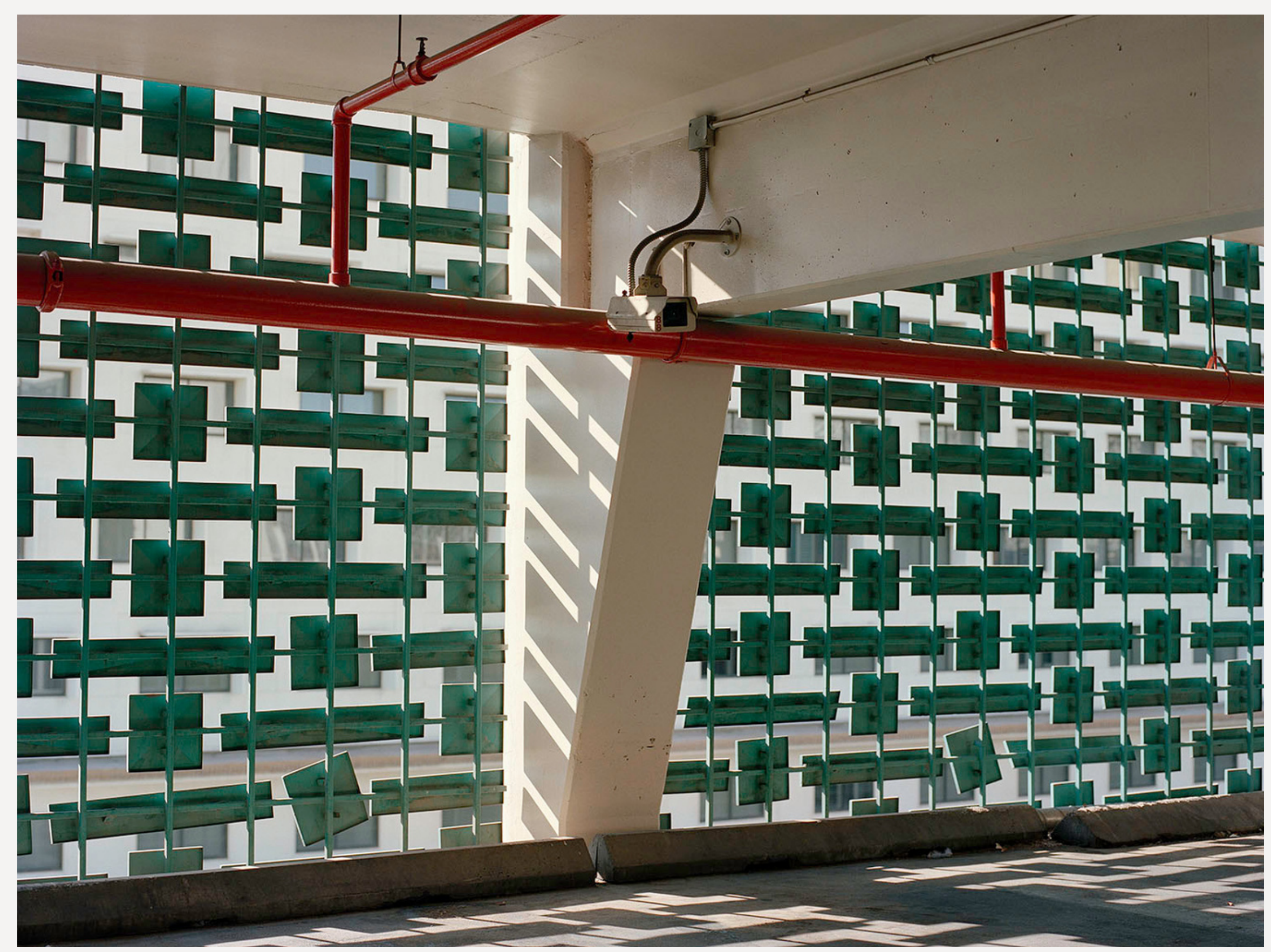
Caitlin Teal Price Surveillance, 2010 Archival Pigment Print, Edition of 5 21x27 inches Contact for Price