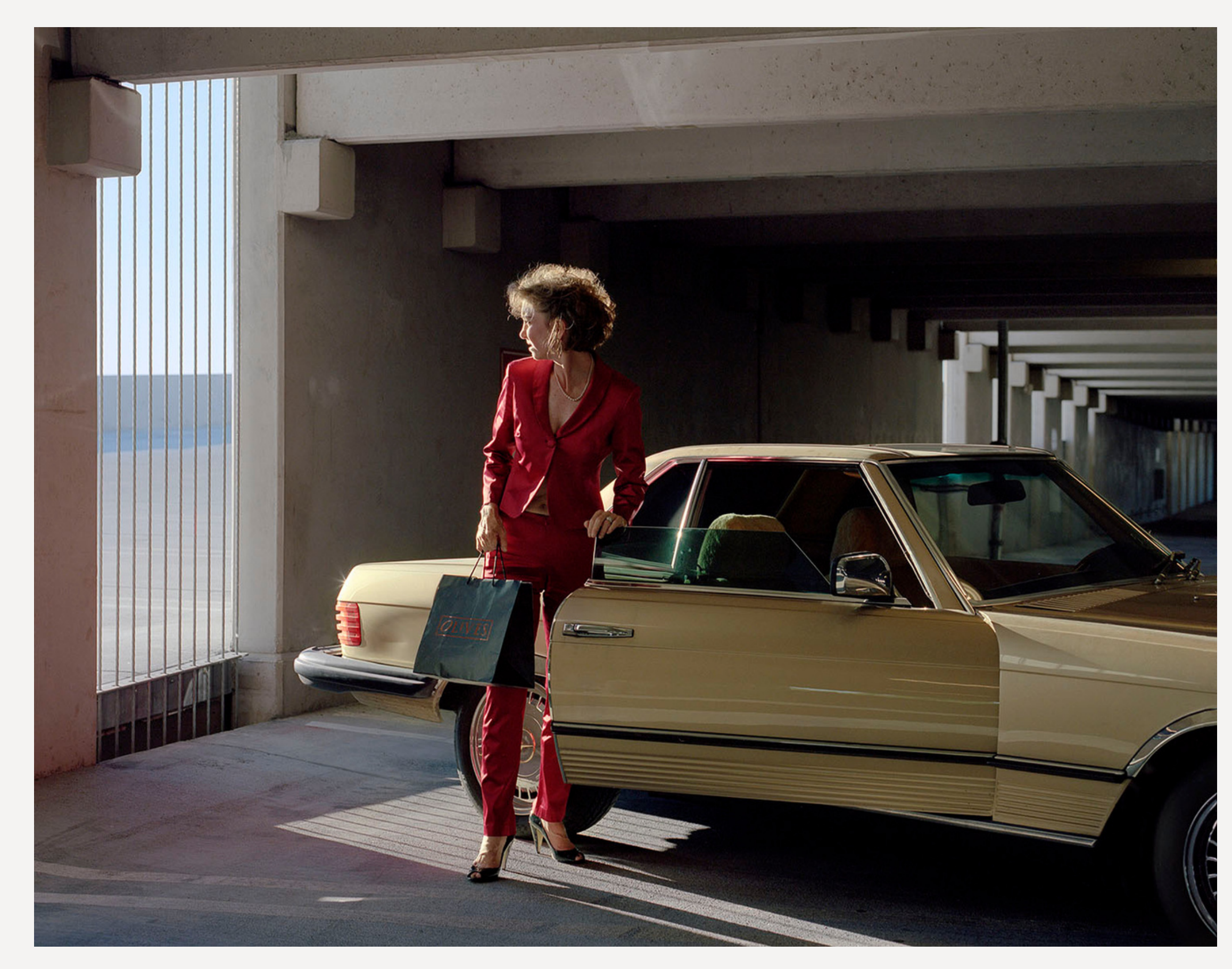
Caitlin Teal Price Clarice in Red, 2010 Archival Pigment Print, Edition of 5 29x36 inches Contact for Price