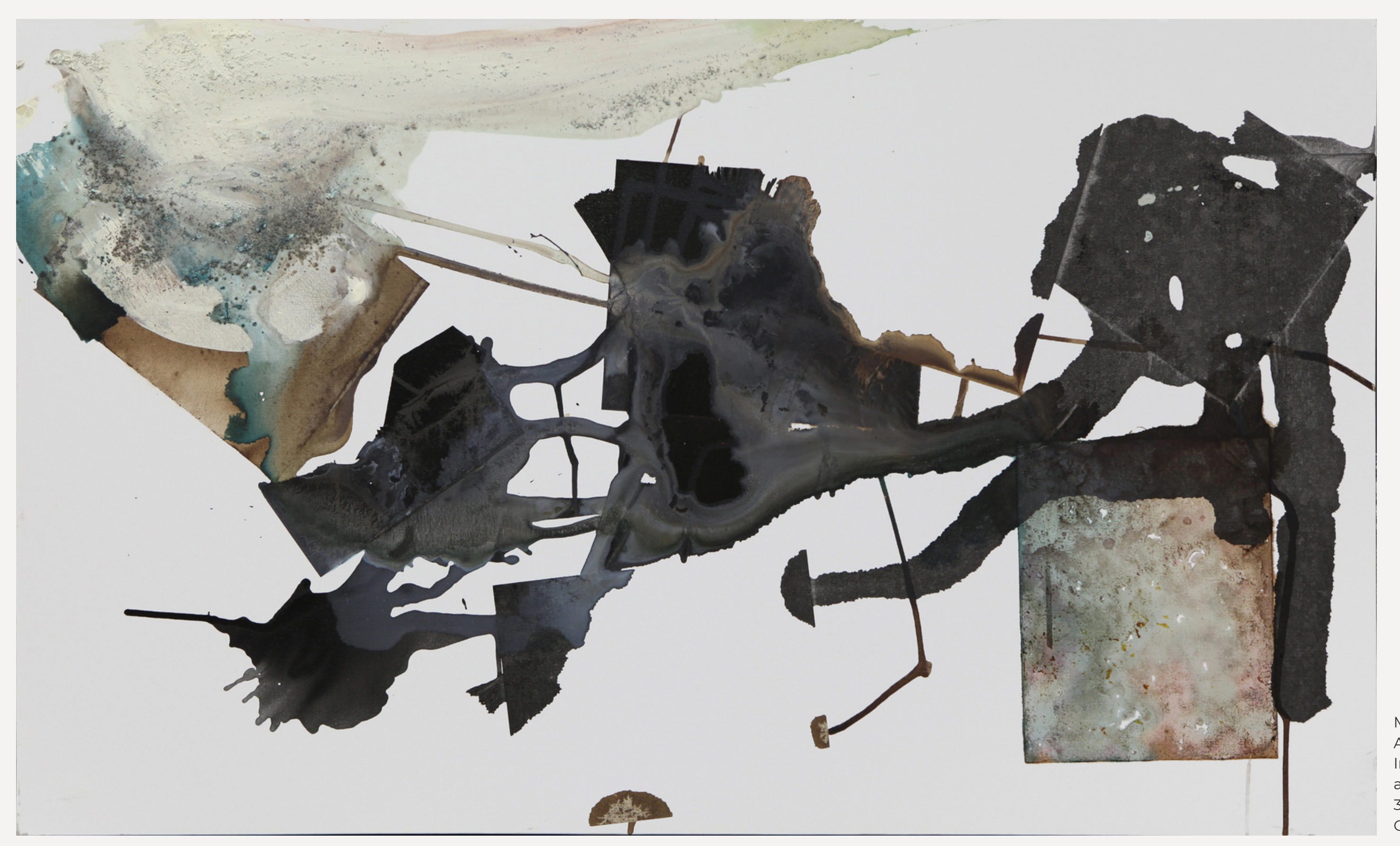
Maggie Michael As for the Future, 2020 Ink, walnut ink, acrylic, metal dust, earth, and stones on canvas 36 x 60" Contact for Price