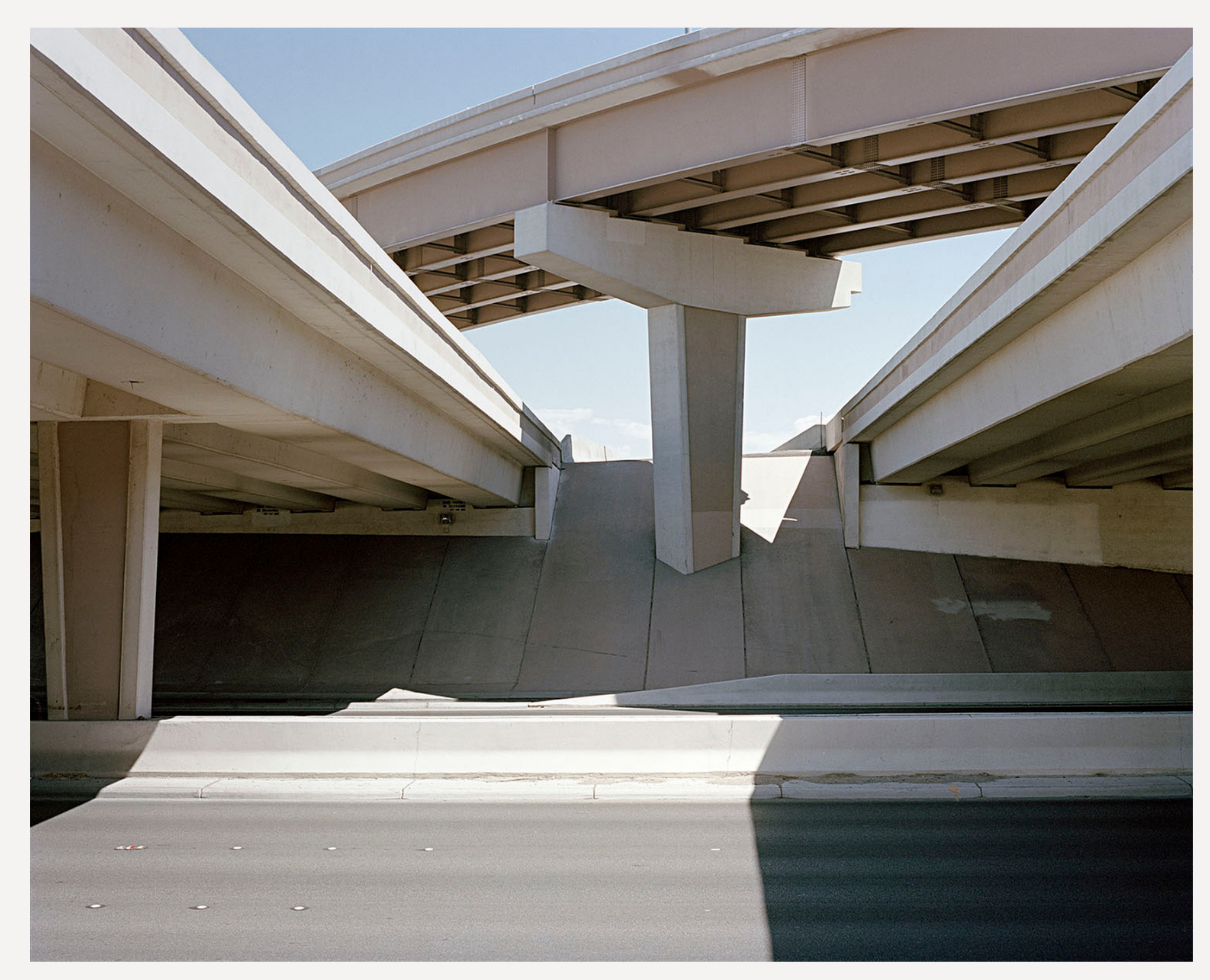
Caitlin Teal Price T, 2010 Archival Pigment Print, Edition of 5, 21x27 inches Contact for Price